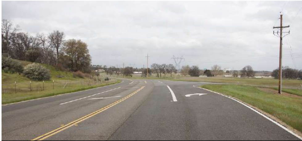
Turn Lanes into Park - Easy Access