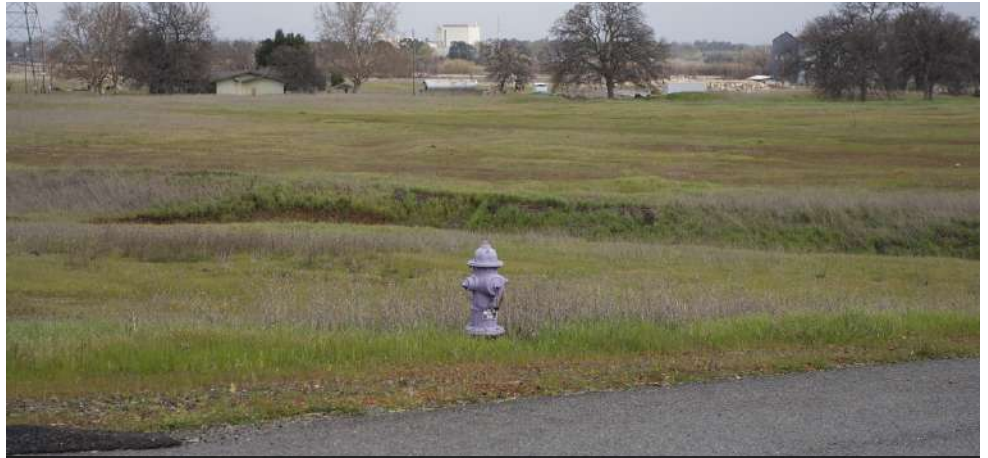
Fire Water for Many Types of Uses